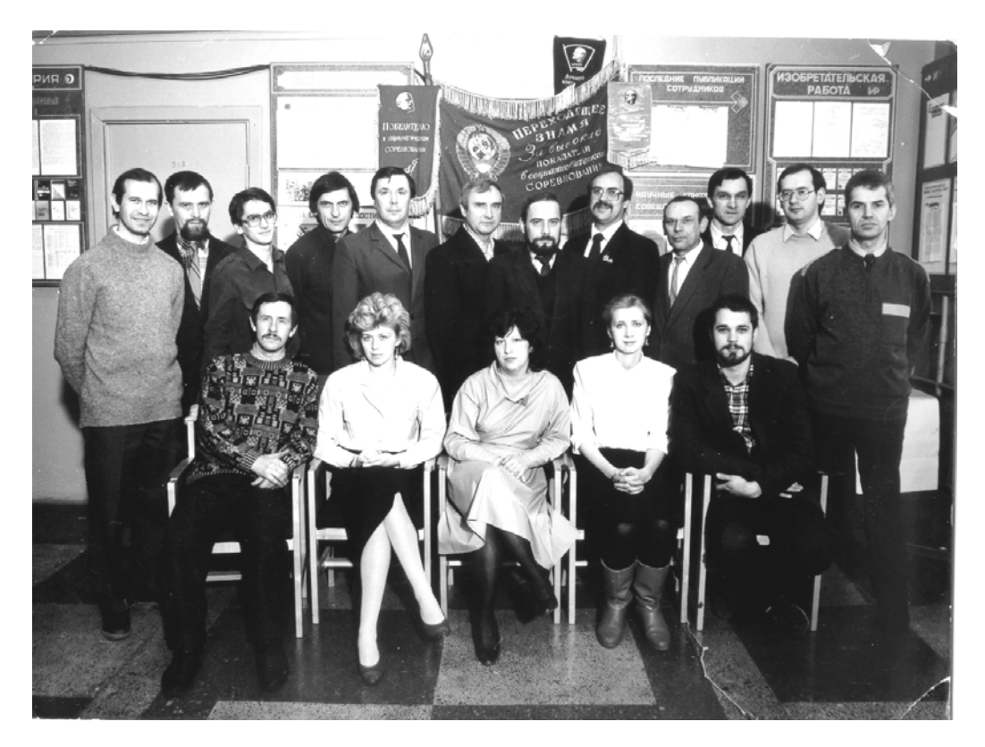
Photo 1. The Winner of "Socialistic competition" of Heat and Mass Transfer Institute in 1987 - Convective and Wave Processes Laboratory.