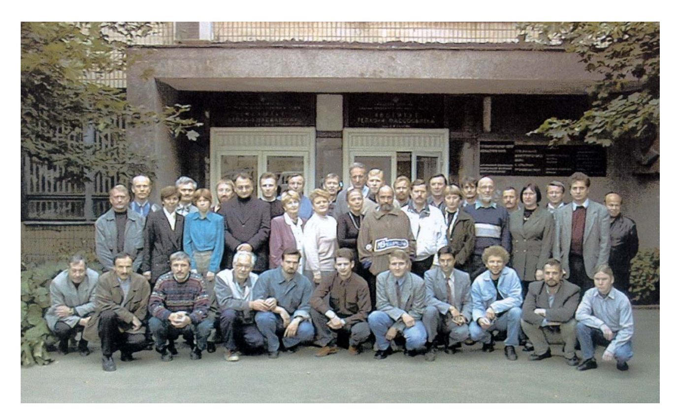
Photo 2. Department of Non-Equilibrium Processes of Heat and Mass Transfer Institute in 2000