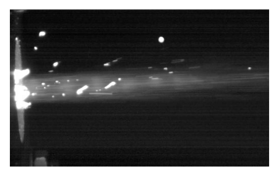
Fig. 1. Flow visualization of spraying process in supersonic plasma jet.

Performed experimental and analytical studies showed that process of plasma melting and conversion of melt into microfibre depend on following main factors: - plasma generator characteristics and operating regimes; - plasma flow formation, spraying characteristics; - plasma forming gas and powder injection mode and place; - size and fraction of sprayed particles, the injection rate parameters and specific details of ceramic fiber formation.